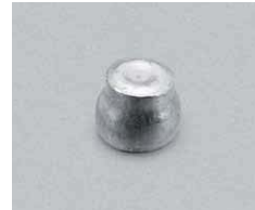
Blindside set view